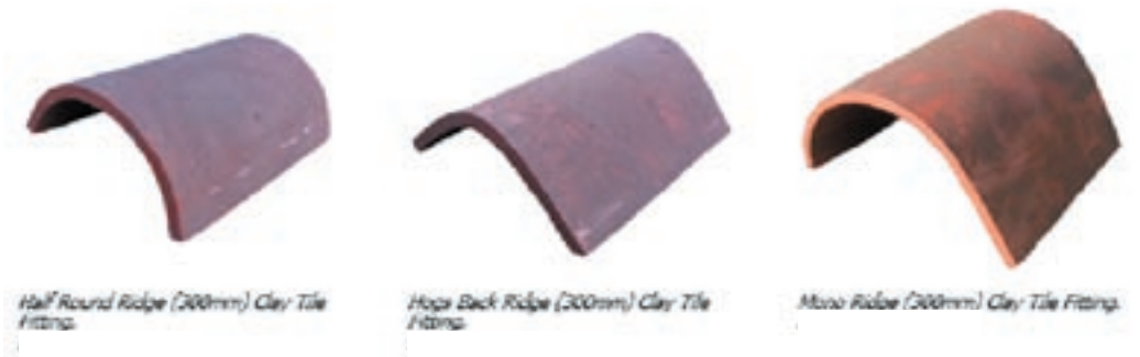
Half Round Ridge (300mm) Clay Tile Fitting.