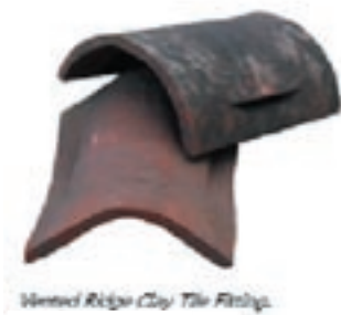
Vented Ridge Clay Tile Fitting.