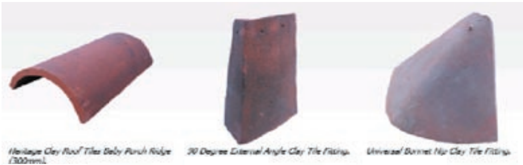
Heritage Clay Roof Tiles Doby Puruh Ridge (300mm).